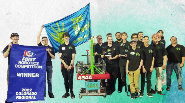
Regional FIRST Robotics Champions Hi Fives Robotics Team #4944